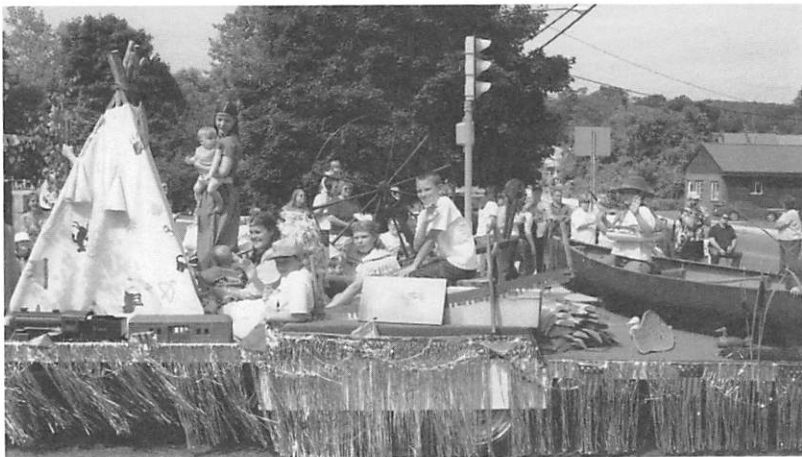
A glimpse of Hinsdale 200 years ago.