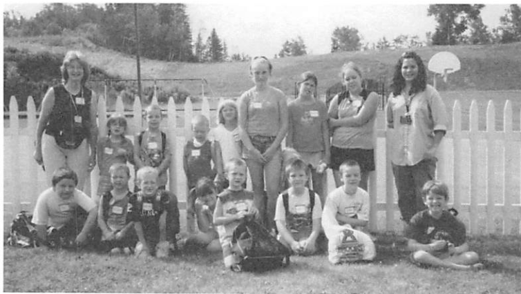
Happy campers pose for a picture on Kid's Day.