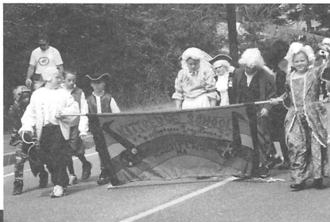
Kittredge School children march in the Parade of Ages.