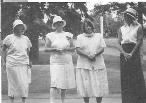
Patently awaiting their turn with the antique clubs.