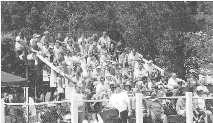
Spectators take in the fireman's muster.