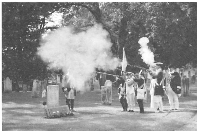
Revolutionary War re-enactors honor Israel Bissell and all our veterans at the Maple Street cemetery.