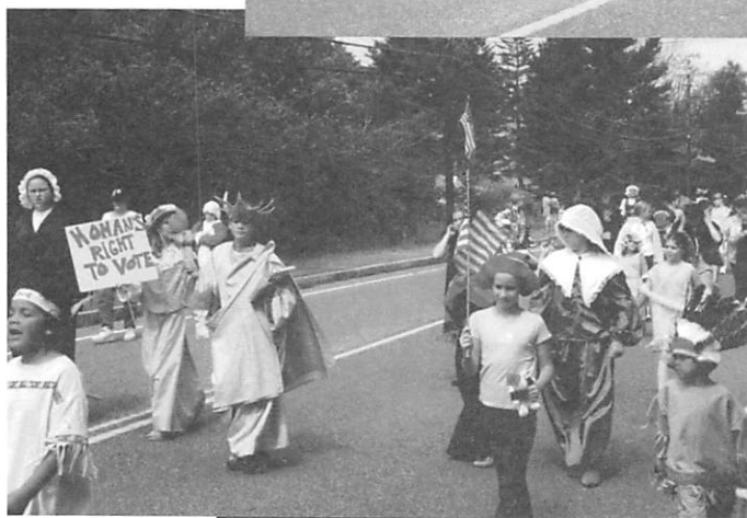
200 years depicted in costumes.