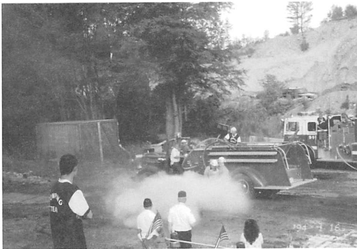
Hindsdale's Foldsville muster team during the oil fire competition.