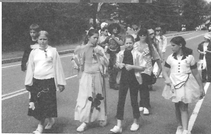
Sock-hoppers and the groovy 70s bring up the rear.