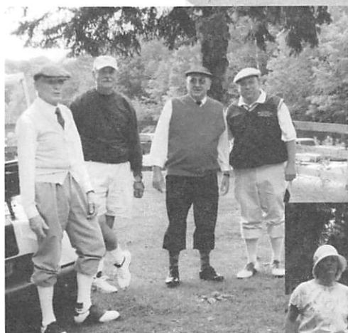
Tournament players don their knickers and argyles for a vintage golf game.