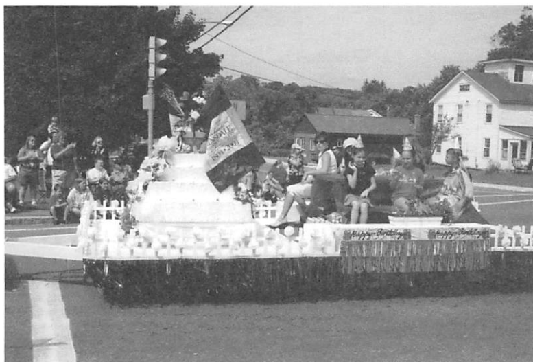
Hinsdale's birthday cake floats down Maple Street.