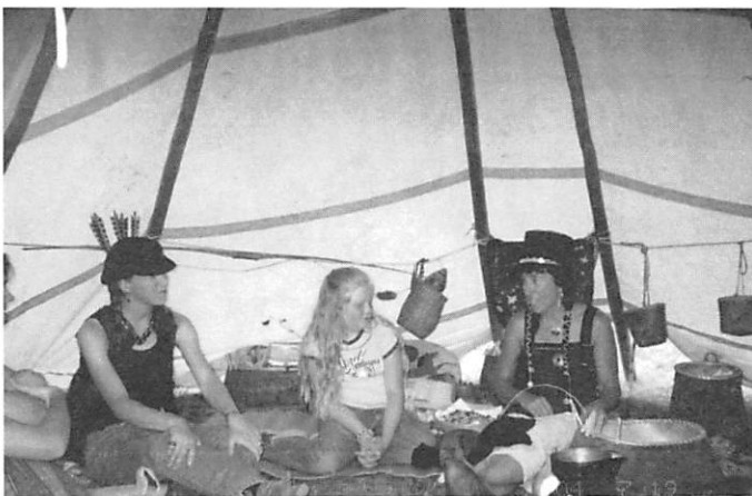
Enjoying Native American folklore.