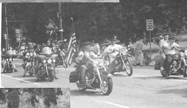
Home to Hinsdale after re-enacting Israel Bissell's Call to Arms ride. Look at all that horsepower!