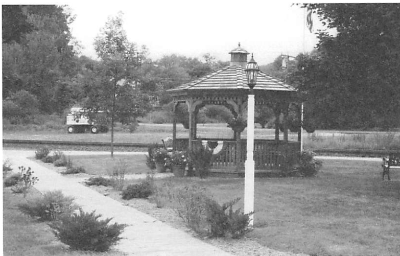
The revitalized Depot Park.